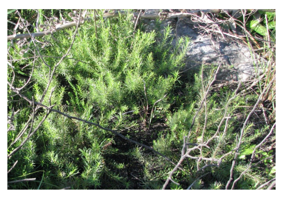
Figure 1. Baccharis coridifolia in the vegetative stage.

animals were necropsied. Tissue samples were collected, preserved in 10% buffered formalin, and processed routinely for sectioning and microscopic study. Sections were stained with hematoxylin and eosin.